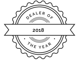
2018 Dealer of the Year % over target