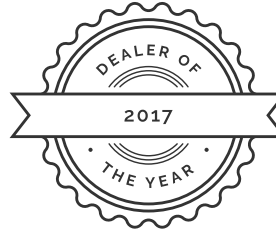
2017 Dealer of the Year % over target

FFR Konica Minolta is a Level 4 B-BEEE Company